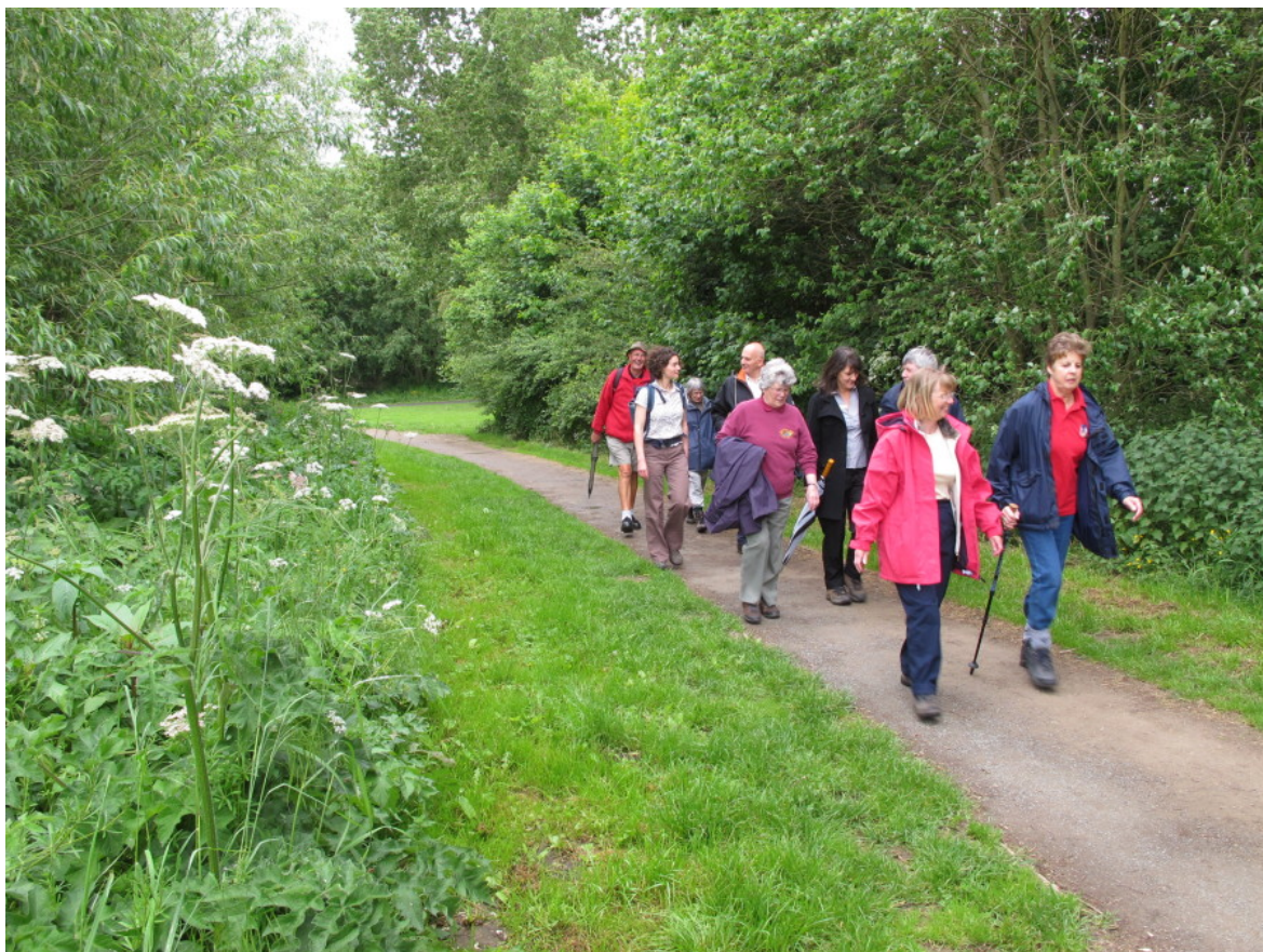
Walkers on the Nantwich Riverside Loop launch event